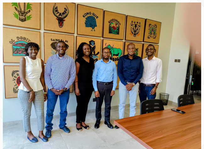
LendXS and Ugacof Teams